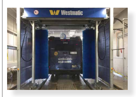
2-Brush Hybrid Drive Through.