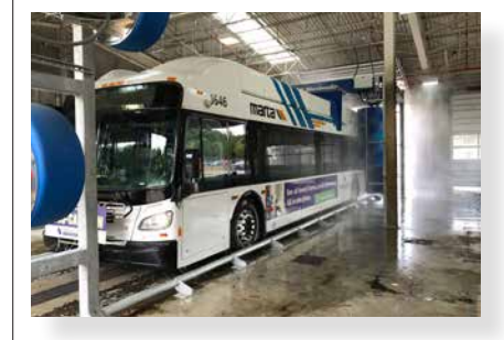
Transit-Master. For buses with front mounted bicycle racks. Dryer system.