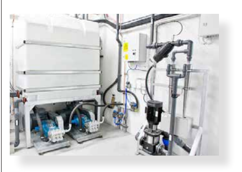
Water Recycling System.